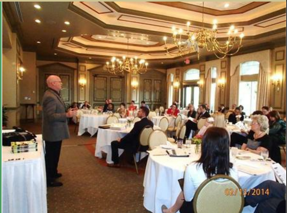
Brown and Brown Inc. provide Safety and Health Seminar in Naples on February 13, 2014